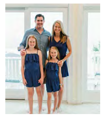
I am driven by trying to always be better. Whether in life, in the clinic, or in the operating room, there is always room for improvement. I feel that setting that example is important as a father, as a mentor, and as a teacher.

Christmas is my favorite. I have 2 young daughters and I love spending that day with them. I am charge of cooking on Christmas morning and a large dinner and it is secretly one of the things I love doing (when I have the time). I always make time to cook on Christmas Day.